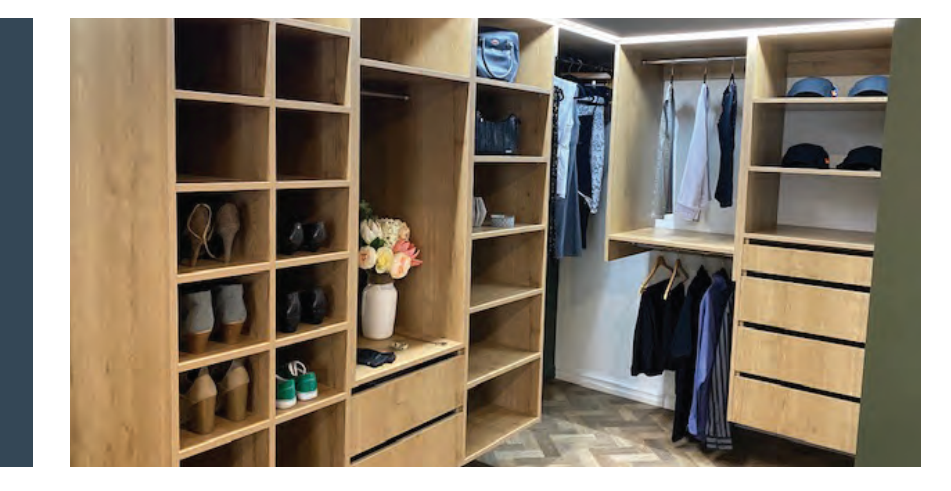
Carroll's also design and fit wardrobes to your requirements, offering consistency and enhancing relationships between both parties if we are following through from the kitchen design to other areas of the build or renovation.