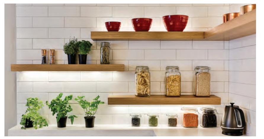
Creating ambiance is a big part of good design and lighting is an important factor. LED strip lighting on shelving, overhead cabinets, pelmets or toe kicks and more can add x-factor and sensor touch convienence.

We have full access to all Fisher & Paykel appliances and can offer our clients the option of supplying these directly for their project - at competitive rates, saving money, plus time and effort of having to shop around.