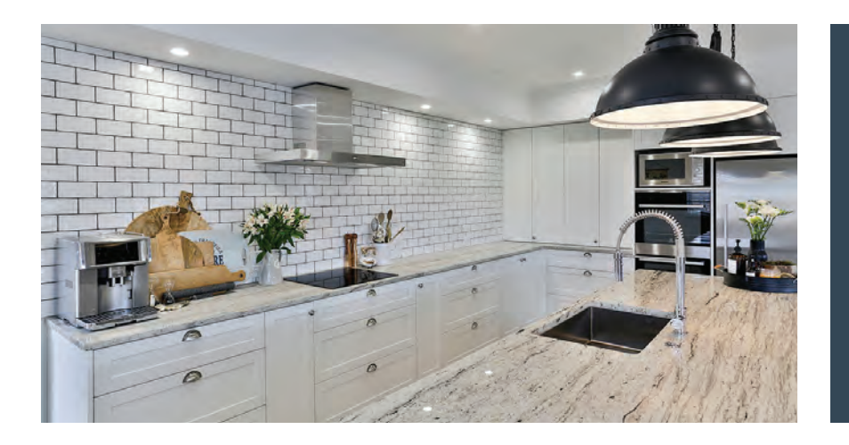
The heart of the home - a well designed kitchen you can enjoy for many years, this is Carroll's speciality. Doing a kitchen well is a great investment - not only for you to enjoy with family and friends but a selling point for future owners.