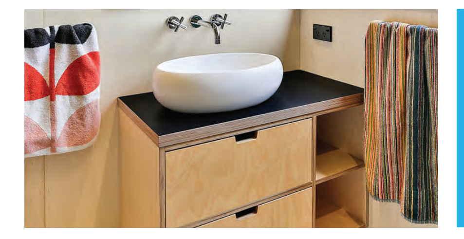
If off-the-shelf isn't going to work for you we can make a custom vanity from a range of materials and sized exactly to your specifications - giving you a unique look and fitting whatever level of storage you need within it.

Our tradesmen custom makes the item from the plans you have created of your design - allowing for a one-off bespoke piece or a custom set. This also includes repairs to timber items that may require preservation.