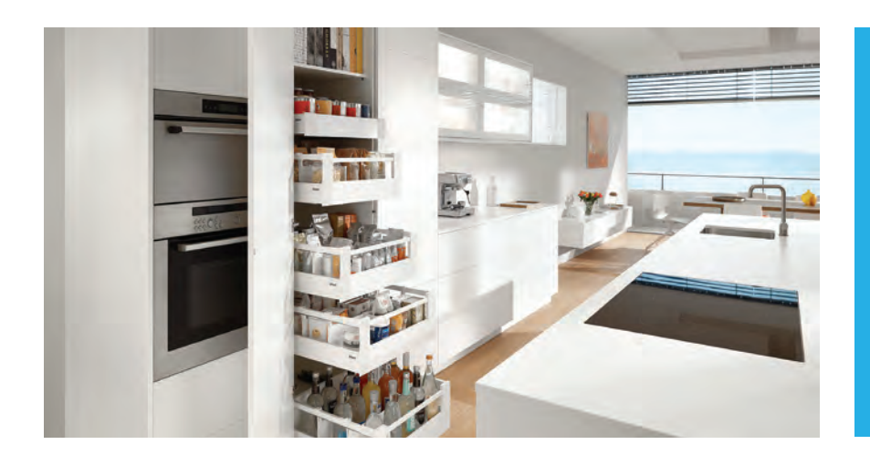
Blum's Space Tower is a great solution for storage. It offers superb access and there's no need to pull everything out to get at the back of the cupboard! You can't beat the ease of sliding out a drawer and having access to all items.

Together we can have you working in your kitchen like a chef! There's a modern storage solution for all items - from cutlery inserts, spice racks, knife blocks, oil pull-outs, bins and more including sinks of all sizes shapes and colours.