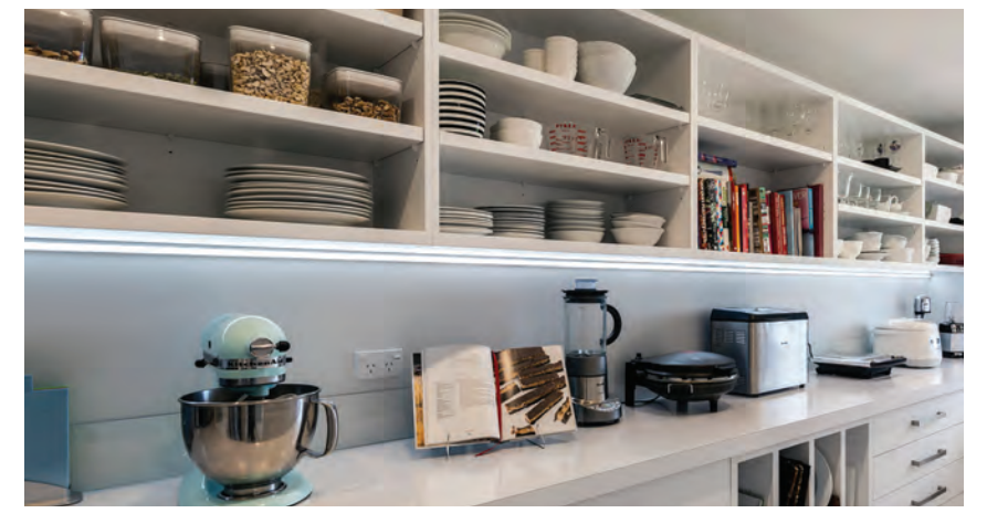
Walk-in pantries have become an integral part of modern living - offering the benefits of a clutterfree kitchen. Within your budget we can also work solutions for utilising maximum storage space when walk-in isn't an option.