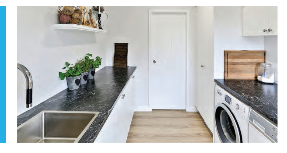
Once considered a luxury - a smart laundry can add value and function to a home. You may not always have the luxury of space so our team are experienced in showing you the best use of space and funtion to create a great laundry.